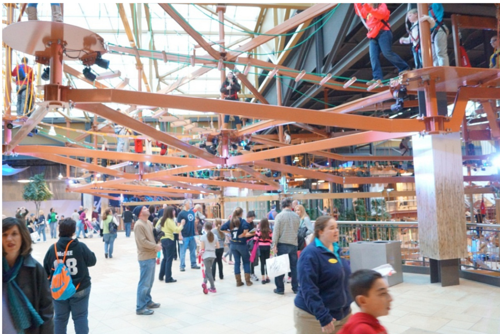
The Canyon Climb Adventure, part of WonderWorks, is the largest suspended ropes course in the world!