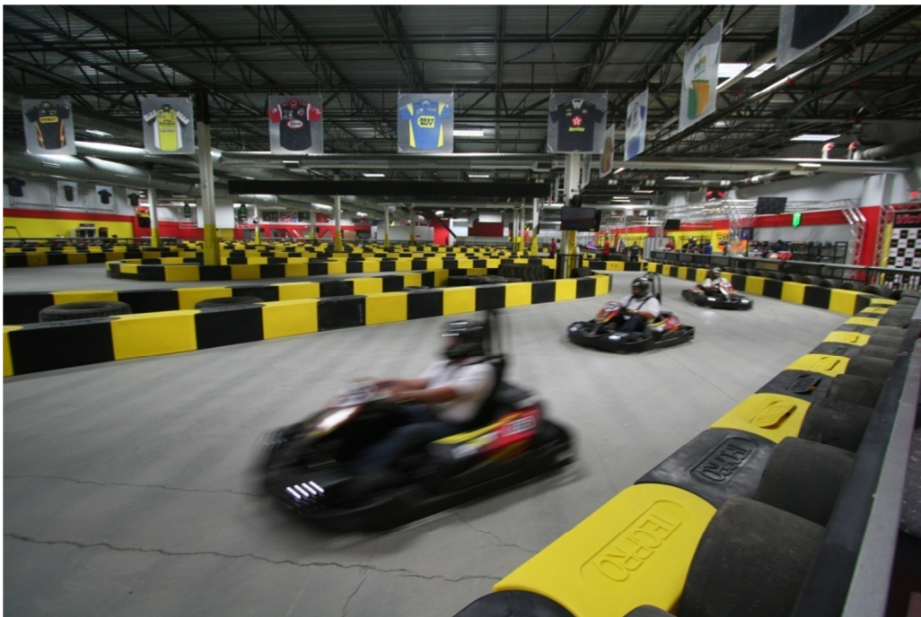
Pole Position Raceway is located on Destiny USA's Level 3