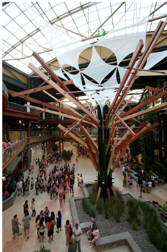
The Canyon area of the Destiny USA expansion

Prepare to be amazed as to what's in store for your adventure inside WonderWorks