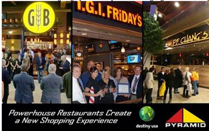
New Restaurants round out Destiny USA's dynamic mix