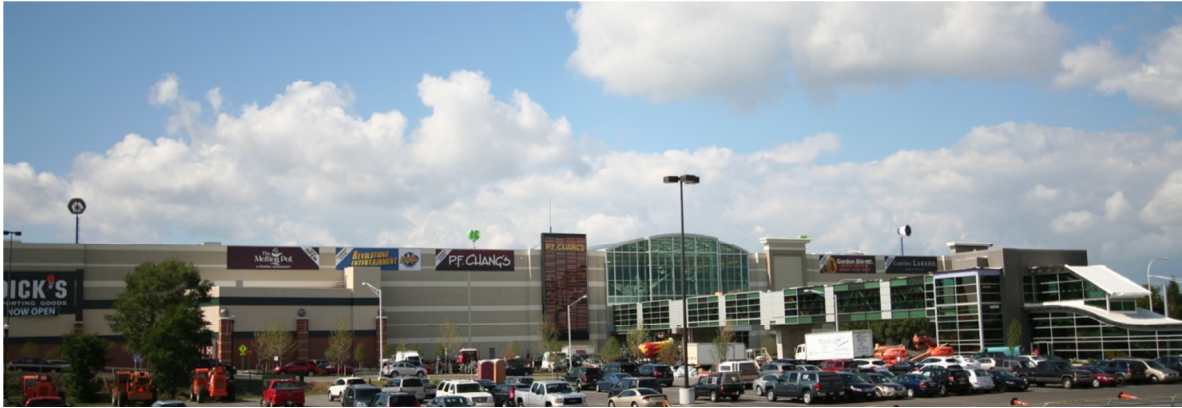
Exterior elements are going up and new permanent signage is now on display