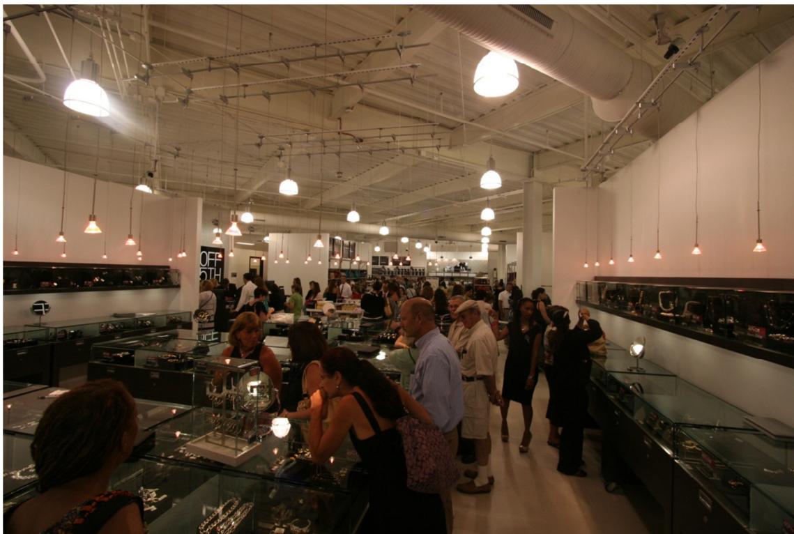
Saks Fifth Avenue OFF 5 th saw 1,600 people for its preview party prior to opening on June 21