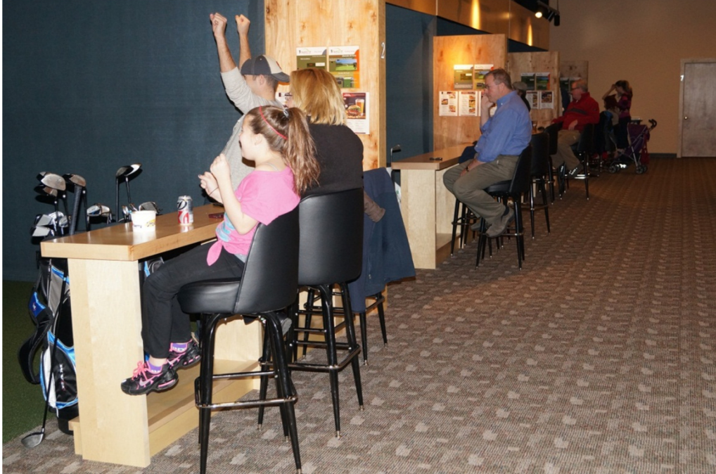
OptiGolf is now open on Destiny USA's Level 3

State Fair. For a complete list of events and more information on Syracuse, New York, go to www.VisitSyracuse.org .