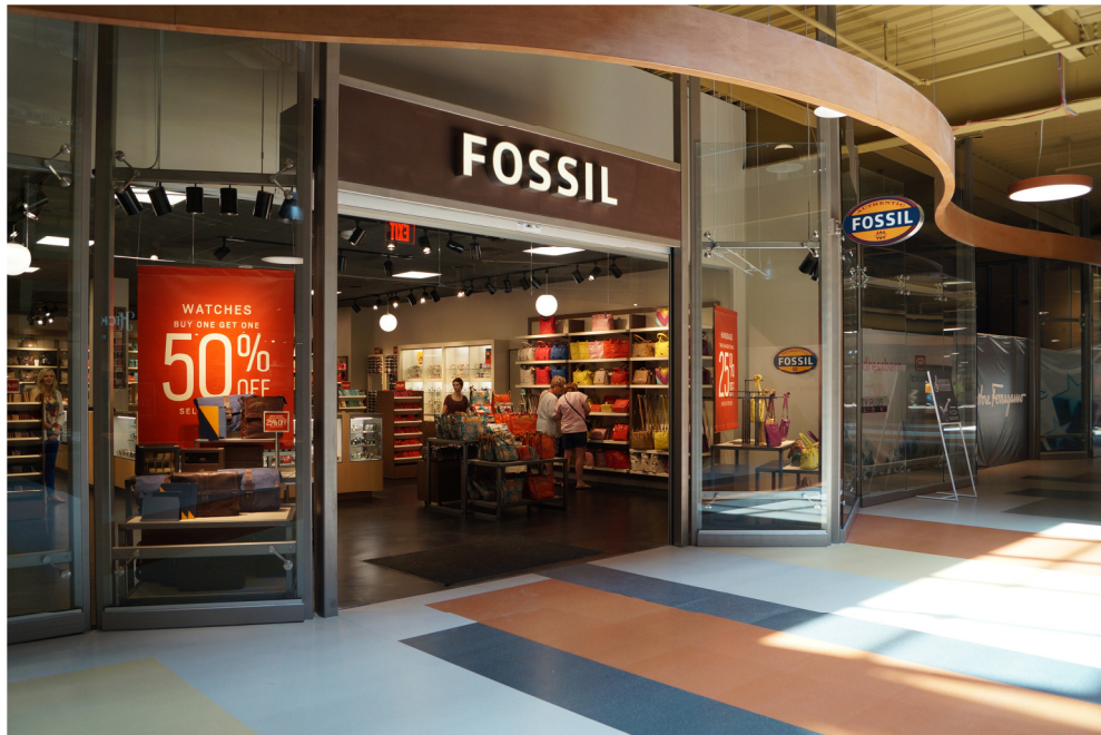
Fossil is one of the many new outlet stores now open in Destiny USA's expansion