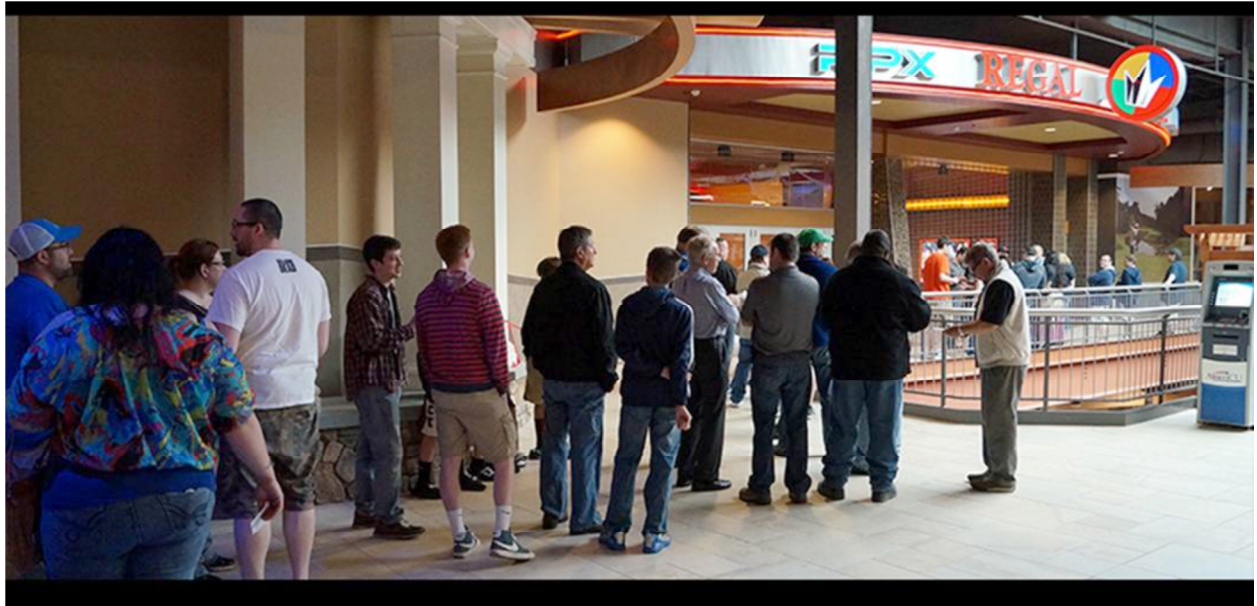
Regal's IMAX and RPX opened to lines on June 14 th