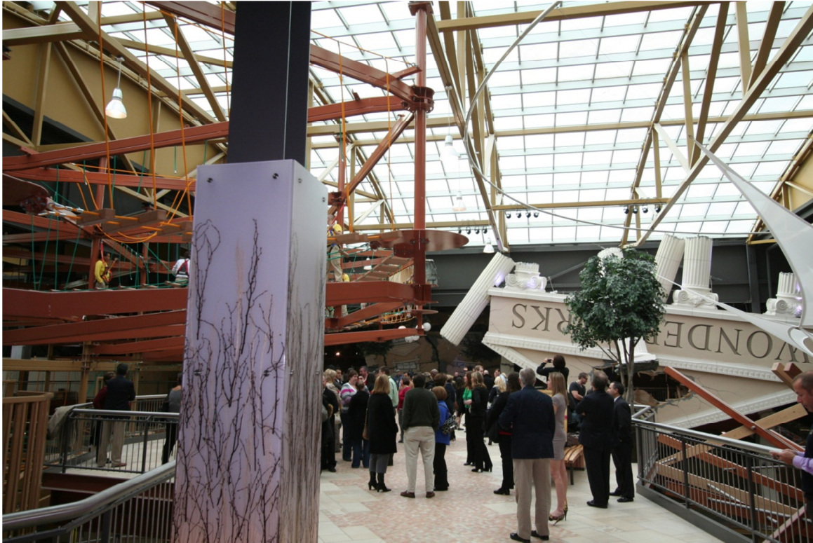
WonderWorks is located on Destiny USA's Level 3