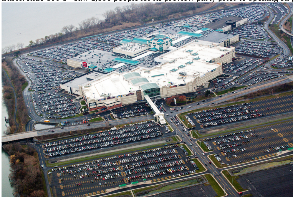
Our pedestrian bridge creates easy access to the facility